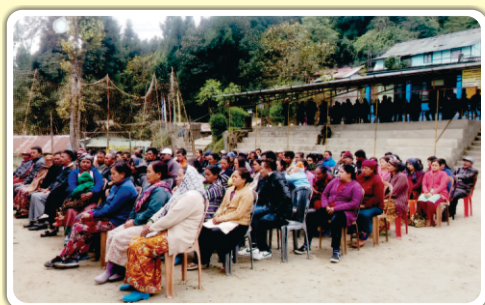
4 th Mile, JN Road, East Sikkim