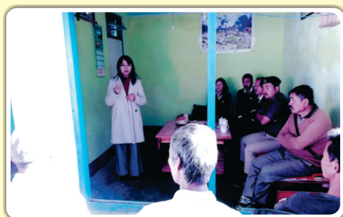
Phuncheybong, West Sikkim