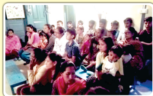
Sishu Bhawan (Missionary of Charity), Sichey, East Sikkim