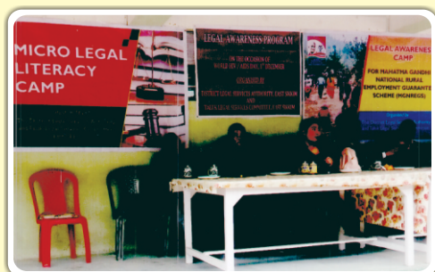
Govt. Jr. High School, 4 th Mile, J.N. Road