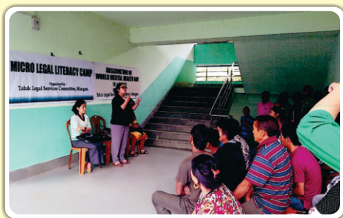
Power Colony, Mangan, North Sikkim