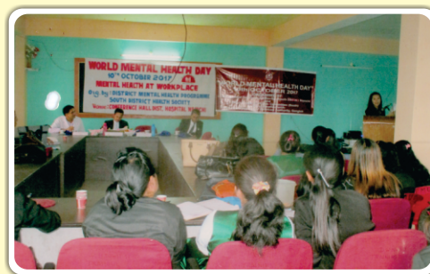
District Hospital, Namchi, South Sikkim