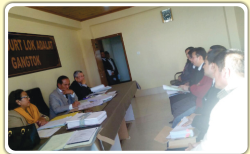
High Court Lok Adalat in progress