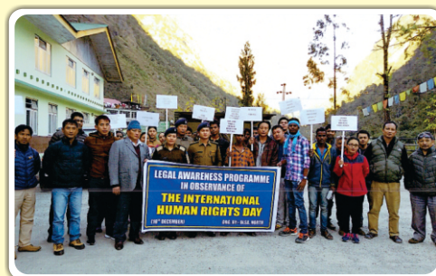
Chungthang, North Sikkim