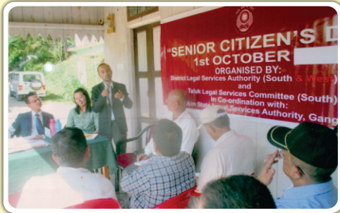
Soldier Board Office, Namchi, South Sikkim