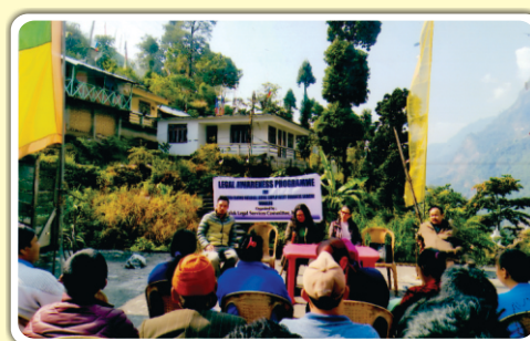
Toong, North Sikkim