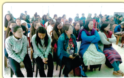
Darap, West Sikkim