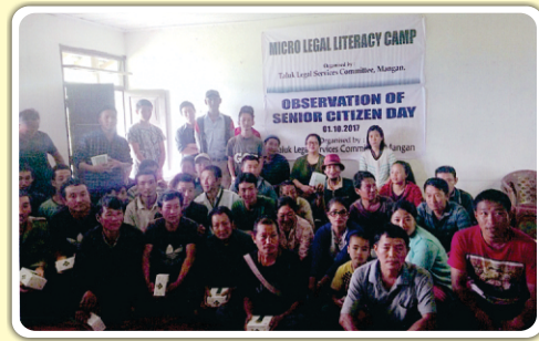
Phensang, North Sikkim