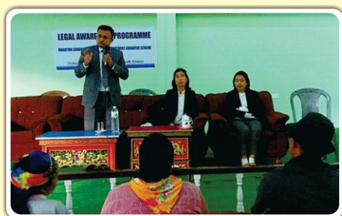
Lingchom, North Sikkim