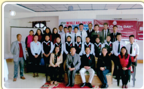
Don Bosco Technical Institute, 12 th Mile, South Sikkim