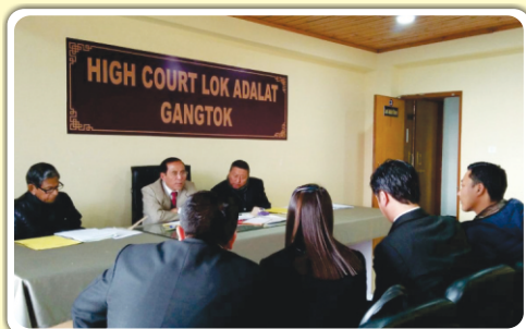
High Court Lok Adalat in progress