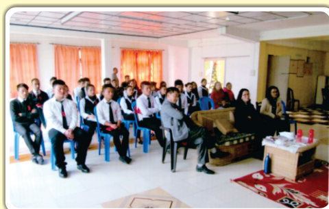
12 th Mile, Jorethang Road, South Sikkim