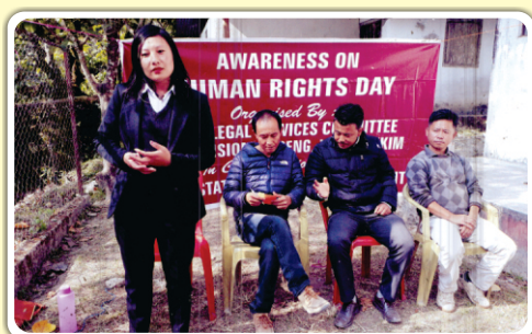
Upper Pakki Gaon, Soreng Sub-Division, West Sikkim