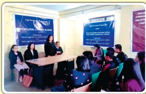
Juvenile Justice Board, Gangtok