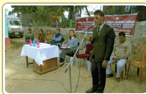
Kateng, South Sikkim