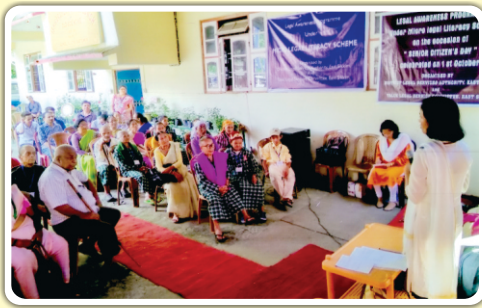
Ishwarrambha Samiti Sangh (Old Age Home) Jalipool, East Sikkim