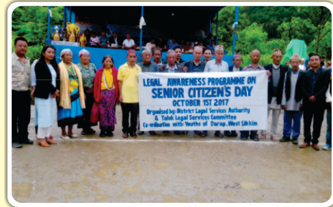
Darap, West Sikkim