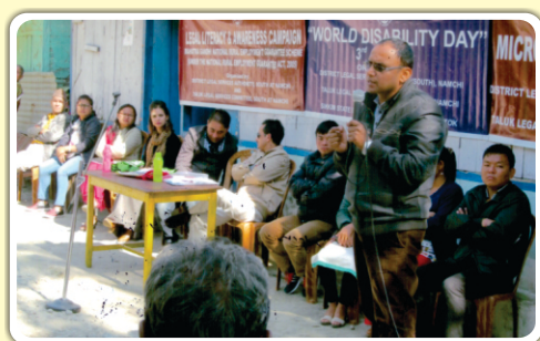
Mangley, South Sikkim