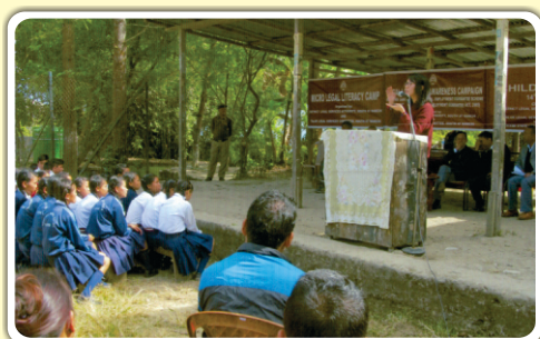
Kateng, South Sikkim