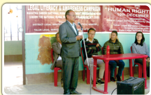
Pamphok, South Sikkim