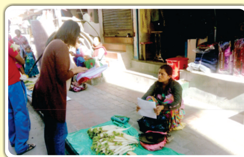
Gyalshing, West Sikkim