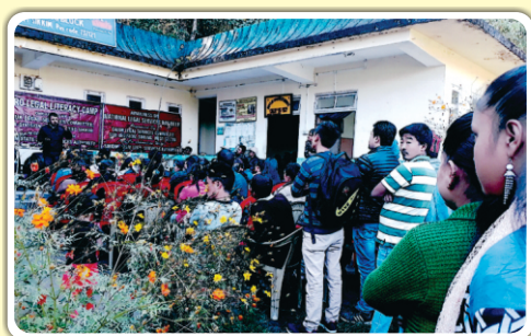
Chumbong, West Sikkim