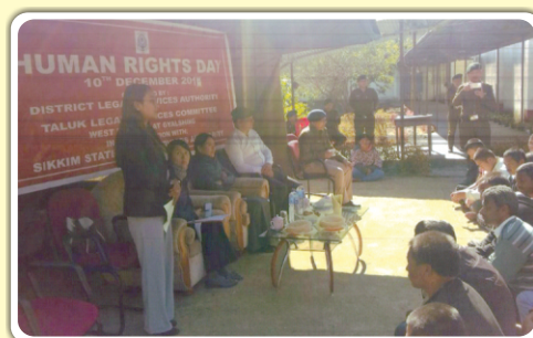
District Prison, Boomtar, South Sikkim