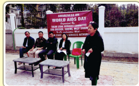
Construction Site of the Court of CJ-JM, Soreng, West Sikkim