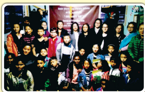
Subh Laxmi Social Organization, Chandmari, East Sikkim