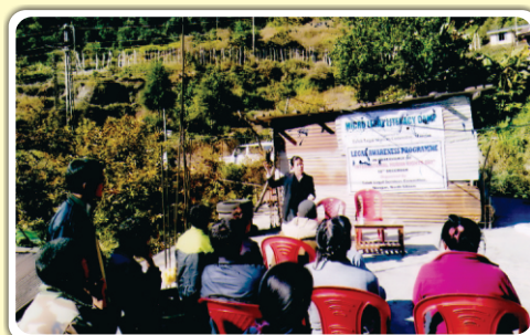
Deythang, North Sikkim