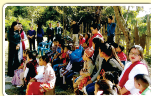
Saraswati Vidhyalaya, West Sikkim