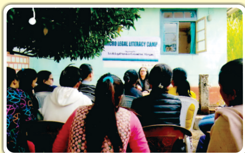
Namok, North Sikkim